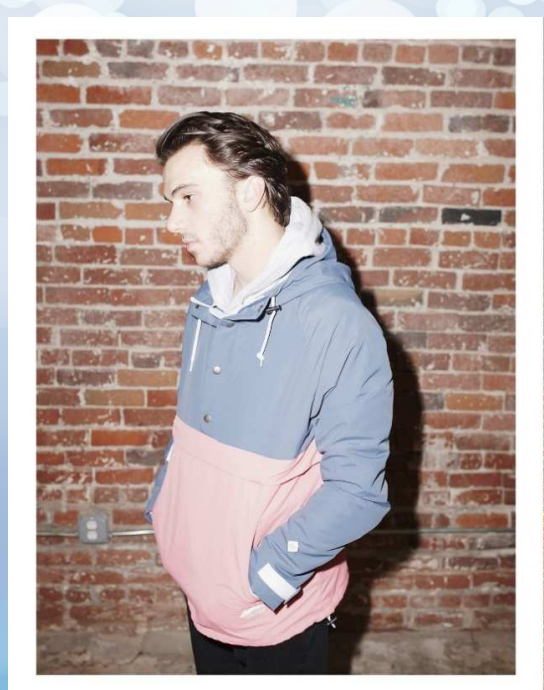
THE LEAGUE OF US

FOR ALL PHOTOGRAPHY NEEDS WWW.THELEAGUEOFUS.COM