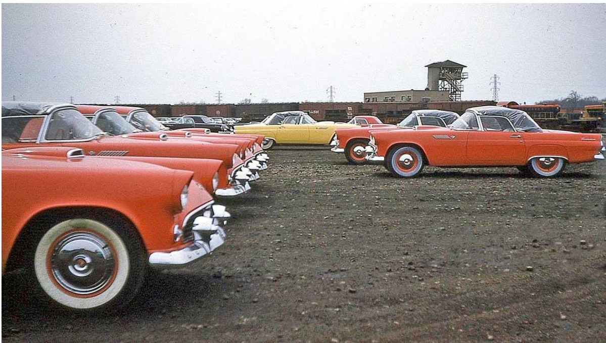
Bill - one of these could be yours