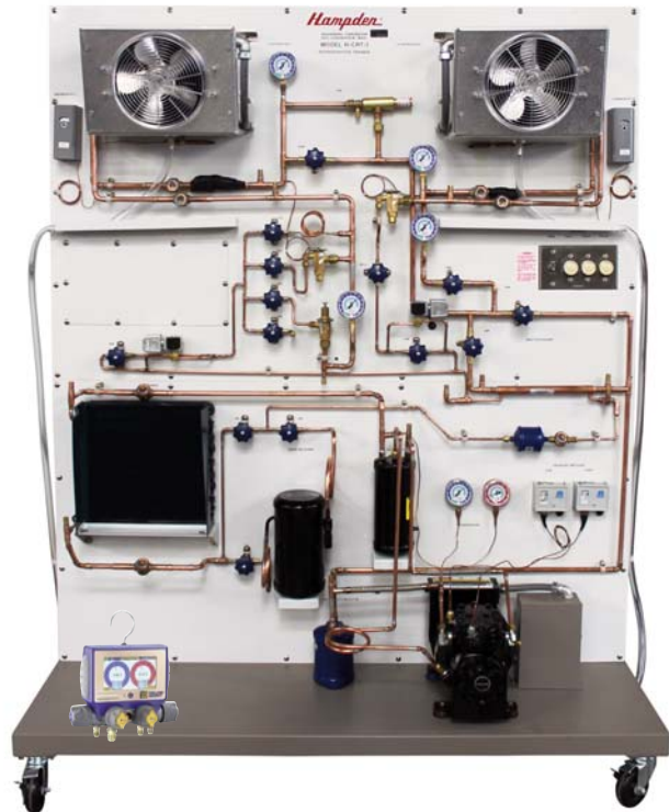
MODEL H-CRT-1 shown with H-RST-DMB Digital Manifold with Bluetooth Dimensions: 88"H x 72"W x 31"D - Shipping Weight: 1,000 lbs