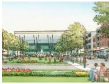
Troy Town Center, Troy, Michigan