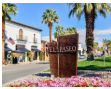
Palm Desert, California

Palm Desert, El Paseo Street Master Plan, 2018 Warren Town Center, Michigan: 2017 Fallen Timbers, Marietta, Ohio: 2017 Haslett, Michigan Town Center Plan: 2017 Okemos, Michigan Village Master Plan: 2017 Wixom, Michigan Town Center Concept Plan: 2016 Troy, Michigan Town Center Master Plan: 2016 Detroit Zoo Parking Plan: 2016 Gateway Innovation District, Lansing, Michigan: 2016 Frankenmuth, Michigan Master Plan for Private Developer: 2016 Crooks Road Site, Troy, Michigan: 2016 Shelby Town Center, Shelby Township, Michigan: 2016 Troy, Michigan: 2015