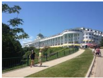
Mackinac Island, Michigan