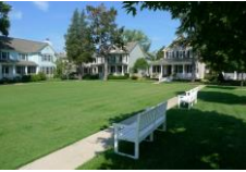
Westwood Common, Beverly Hills, Michigan