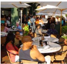
Easton Town Center, Columbus, Ohio