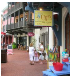
Rosemary Beach, Florida