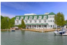
Hotel Walloon, Walloon, Michigan