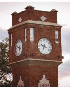
Cuyahoga Falls, Ohio