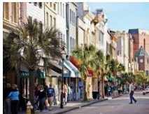
Charleston, South Carolina