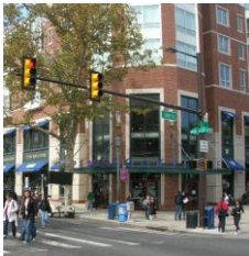
University of Pennsylvania

Prairie Crossings Town Center, Chicago, Illinois: 2001 Asher Village, Linden, Michigan: 2001 Regional Town Center, Draper, Utah: 2001 Coffee Creek Town Center, Chesterton, Indiana: 2001 Multiple Town Center Master Planning, Draper, Utah: 2000 Coconut Point Town Center/ The Simon Company, Bonita Springs, Florida: 2000 Glenview Town Center, Glenview, Illinois: 2000 Eton Street Station Master Plan, Birmingham, Michigan: 2000 Shelby Town Center, Shelby Township, Michigan: 2000 Analysis and Zoning Review, Bay City, Michigan: 1999 Master Landscape Plan, Cherry Hill Village, Michigan: 1999 San Elijo Village Center Master Plan, San Diego, California: 1999 Mt. Laurel Village Center Master Plan (DPZ lead), Birmingham, Alabama: 1998 Northwest Landing Town Center (Calthorpe Associates lead) Dupont, Washington: 1998 Town Commons 60-acre TND, Howell, Michigan: 1998 Washington Village Master Plan, Washington Township, Michigan: 1998 Heritage Village Master Plan & Landscape Plan, Waterford Township, Michigan: 1997 Westwood Village Master Plan & Landscape Plan, Beverly Hills, Michigan: 1996-1997 Kentlands Town Center Expansion Master Plan (DPZ lead), Gaithersburg, Maryland: 1996 Aberdeen Town Center, Valparaiso, Indiana: 1995 Mayfield Park Village Master Plan, Mayfield Township, Michigan: 1995 The Vistas Master Plan & PUD approval, Novi, Michigan: 1993 Woodside Village 800-acre Master Plan, Grand Blanc, Michigan: 1991