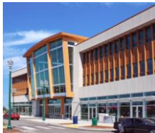
University Place Town Center, Washington