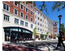
Storrs Center, Connecticut