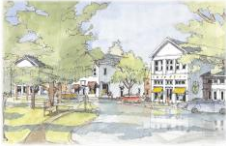
Interlochen Village, Michigan