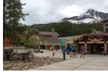
Big Sky Resort, Montana