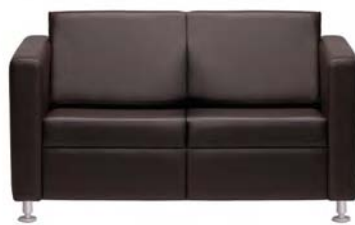
2002 A : 53" C : 18" E : 17"