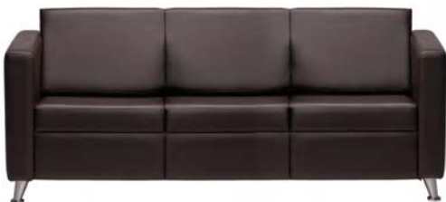
2003 A : 75" C : 18" E : 17"