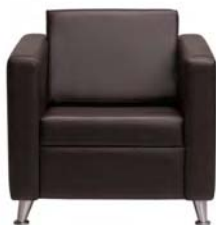
2001 A : 31" C : 18" E : 17"