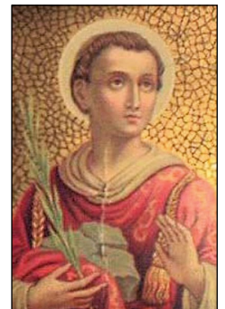
Feast Day: December 26