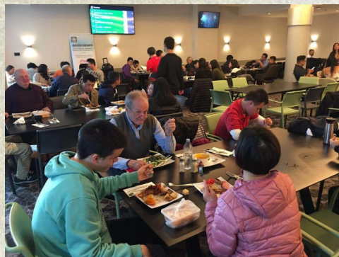
Father's day and moon festival