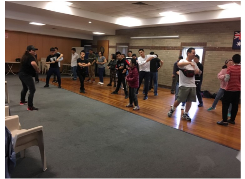
Belmore Dance Class