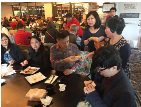
Moon Festival & Father's Day Celebration