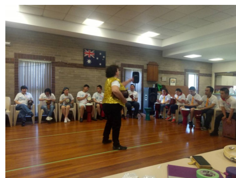
Carers Week Celebration