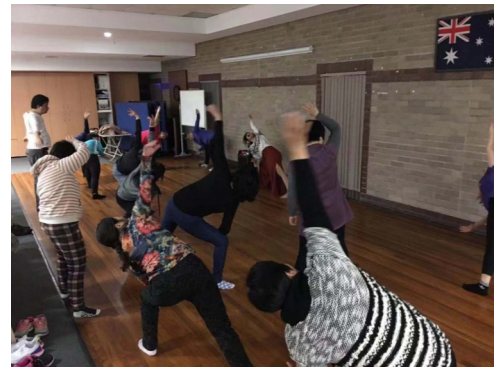
Mum to Mum Activity