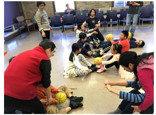
Fun to Learn