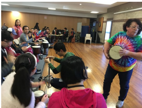
Drumming & Dancing