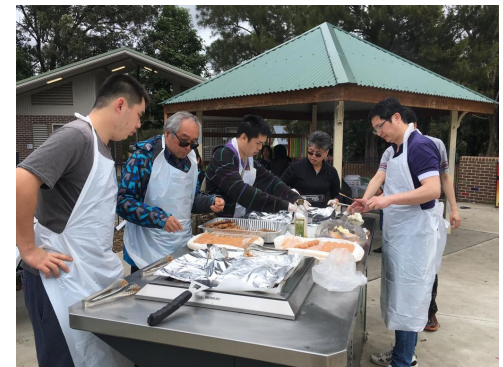
Picnic at Variety Levvi's Place