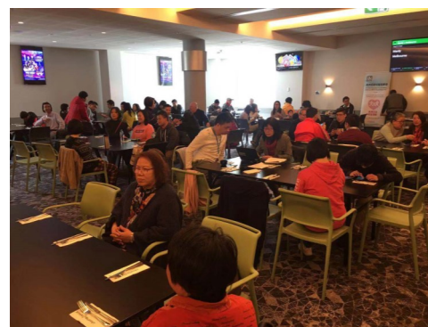
Cooking & Music Fun