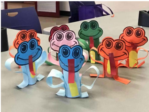
Fun to Learn Activity