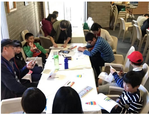
Art & Craft