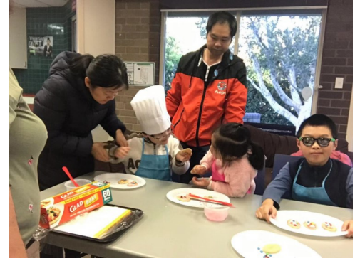
Dance & Cooking Fun Class