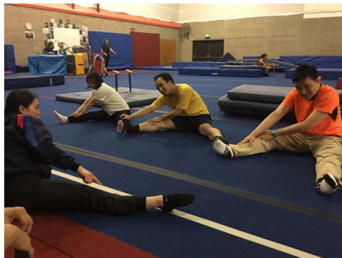
PCYC GYM Activity