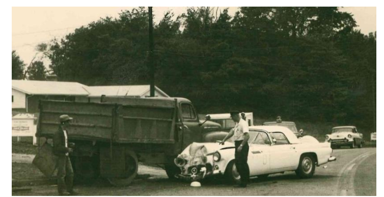
Another sad picture of a Tbird