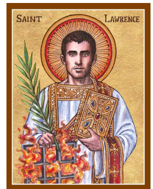
Feast Day: August 10