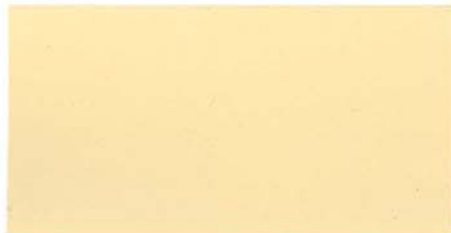
303 Ivory Cream