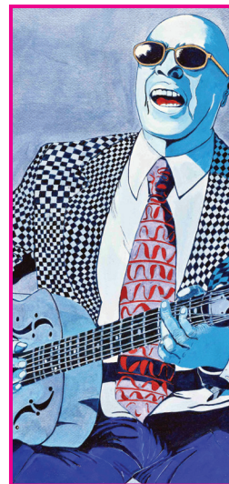
Original art by Artist Samuel Pace, Los Angeles, CA

Are you looking for original oil or watercolor painting, pottery or one of a kind sculpture? What about custom jewelry, glasswork or mixed media? The Northwest is home to many talented fine artists and crafters. The Festival invites and proudly presents a limited and select number of professional artists from Washington, Oregon, Idaho and California to display and sell their art during the Festival.