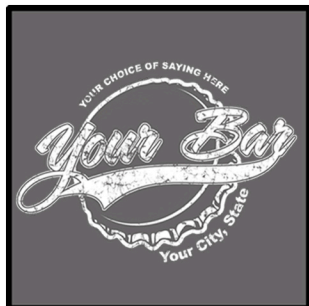
Design name: BOTTLECAP