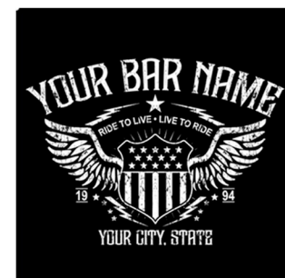
Design name: BIKER WINGS