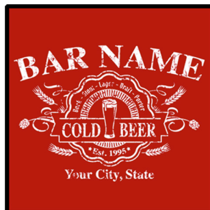
Design name: COLD BEER