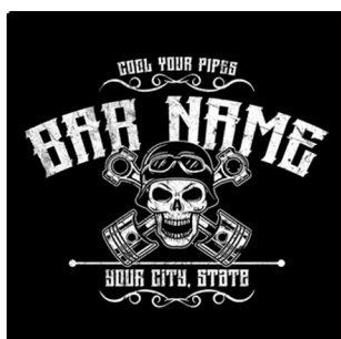
Design name: BIKER SKULL