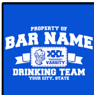
Design name: DRINKING TEAM