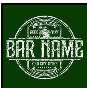
Design name: GOOD TIME