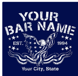
Design name: AMERICAN EAGLE