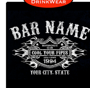
Design name: BIKER SHIELD