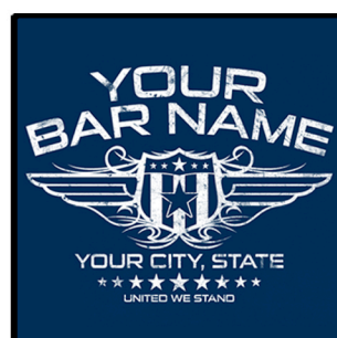
Design name: UNITED