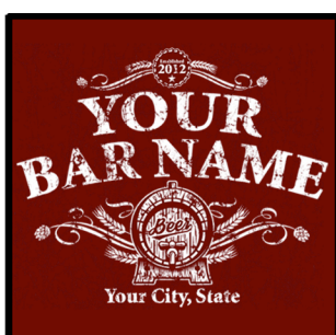
Design name: BEER KEG