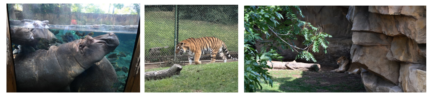
Shira Khan To be feared but becoming