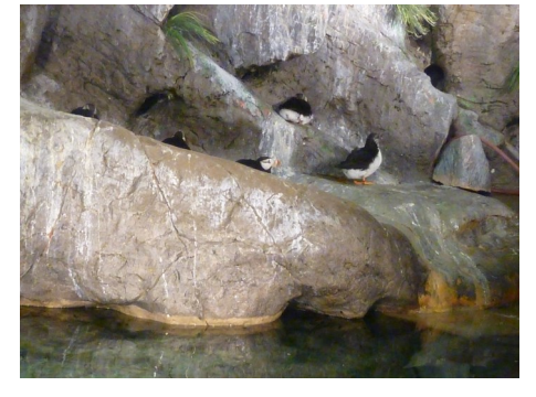
Pity the arctic creatures in a temperate climate