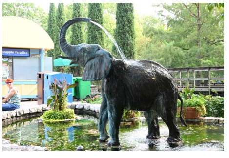
One of many amazing life-like statues