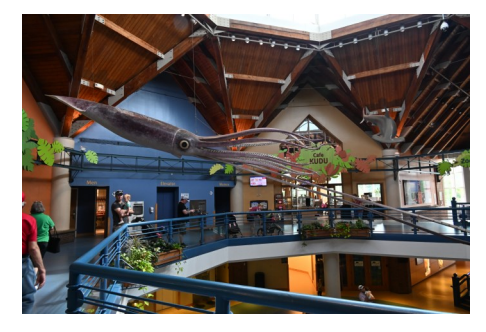
The Main Entry Hall