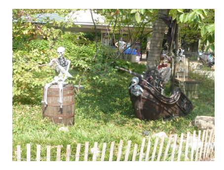
Halloween is coming and they are heading for the zoo