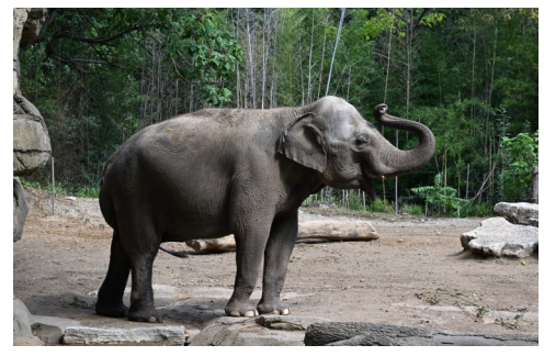
The real thing