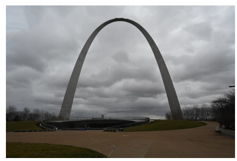
The Gateway Arch—St. Louis' current main attraction