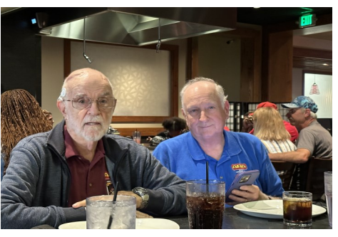
The hapless hosts pause to refresh.