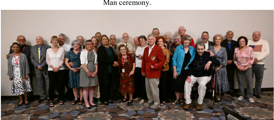
The Good, the Bad and the Ugly