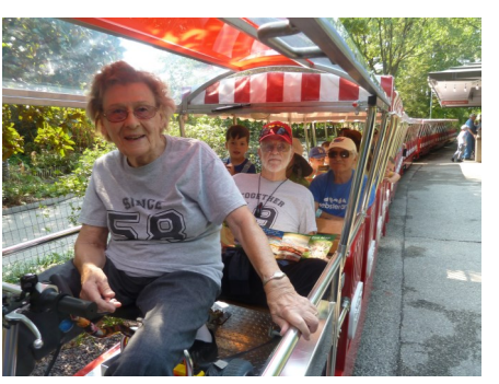
The really big kids enjoy the train ride around the zoo - especially rigged for the disabled