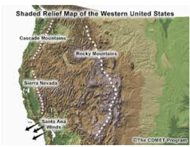
Map Of The Sierra Nevada Range Heading South

By January 27, 1844, the expedition – some 27 men, 67 horses and mules, and a wheeled cannon – is strung out and stymied in the mountains. Charles Preuss captures the moment.