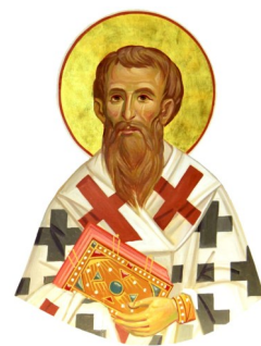
Feast Day January 2