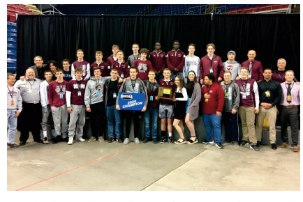
Bismarck High swept the team titles during the 2019-20 wrestling season. The Demons were WDA regular season champion; West Region Tournament champ; Class A dual winner; and Class A overall champion.