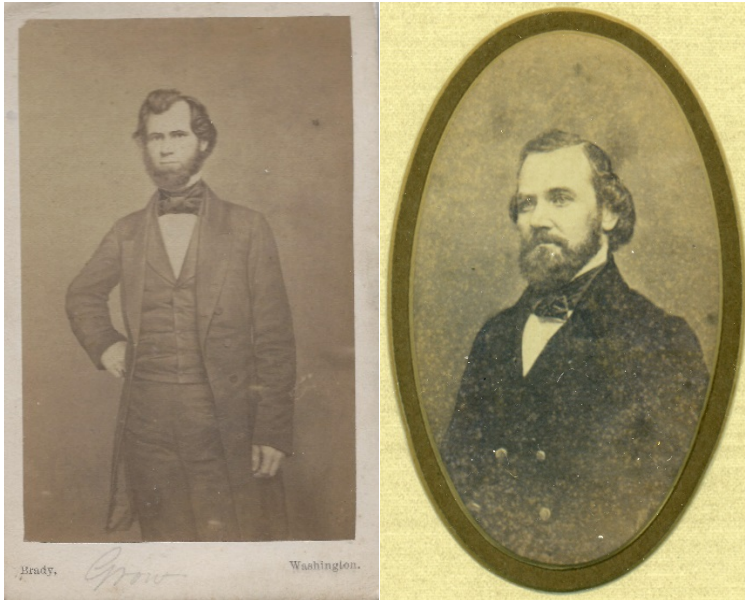
Galusha Grow (1823-1907)