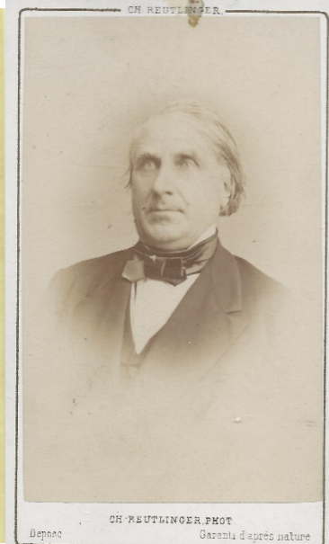
Elihu Washburn (1816-1887)

The fisticuffs continue until Barksdale put his wig back on sideways -- the sight sufficiently disarming to produce a truce among the exhausted combatants.