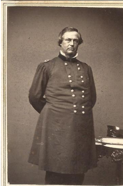
James Denver (1817-1892)

The time has now arrived for the people of Kansas to vote on the Lecompton Constitution.