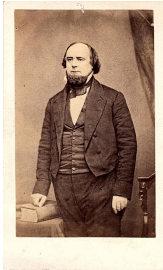
James L. Orr (1822-1873)

As the evidence from the Kansas elections becomes clear in Washington, Northern Democrats – even in his home state of Pennsylvania -- turn up the heat on Buchanan to abandon his commitment to the Lecompton Constitution.