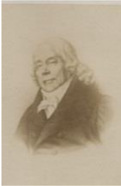
French Minister de Talleyrand (1754-1838)

Between October 1797 and July 1798 the American delegation is subjected to a series of humiliations at the hands of the French Foreign Minister, Charles Maurice de Talleyrand-Perigord.