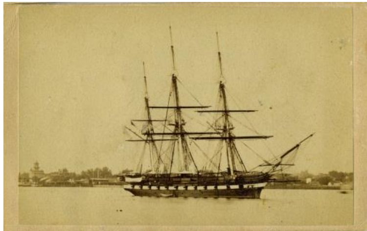
U.S.S. Constitution, Commissioned in 1797.

As 1798 closes, Adams' efforts to hold out for peace are being off-set by Hamilton and even Washington, both apparently eager to fight the French. Secretary of War McHenry conspires in the effort, sharing secret documents with Hamilton while cautioning him to act surreptitiously.