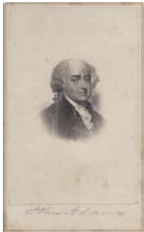
John Adams (1735-1826)

With Washington retiring, the United States experiences its first genuine "race" for the presidency, in 1796.