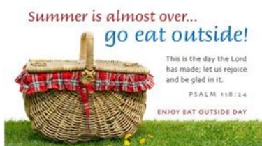
Eat Outside Day