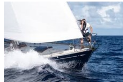
Ride the Wind Day