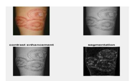
Fig 3. Image Processing: The converted gray scale, contrast enhanced and Median filtered images. Then, suspicious regions of the pre-processed skin images are segmented usingWatershed algorithm.