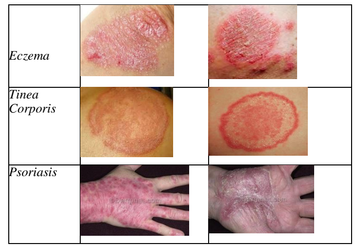
Fig 2. Sample of Skin Disease Images.

Homogeneity: The values range from 0 to 1. Returns a value that measures the closeness of the distribution of elements in the GLCM to the GLCM diagonal. Homogeneity is 1 for a diagonalGLCM. After segmentation, GLCM features are extracted for each sample image as given inTable1.