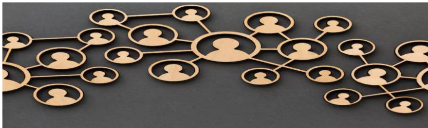
Designed by Freepik