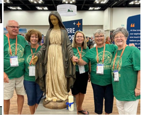
A moment with our Blessed Mother in Indianapolis! ►