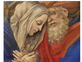
Feast Day: July 26