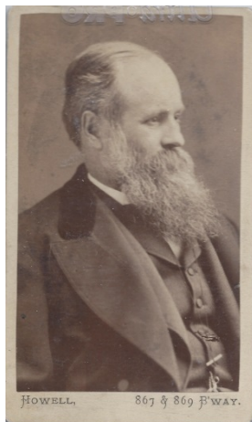
Charles Dana (1819-1897)

Brook Farm is the brainchild of the Transcendentalist couple, George Ripley, and his wife Sarah. In 1841, Ripley's letter of resignation as Unitarian pastor of his church captures his dismay over the “selfish competition” driving mankind, and the failure of organized religion to confront it.