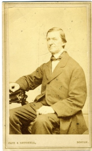
Ralph Waldo Emerson (1803-1882)

The 1830's are also a time of great restlessness among the New England religious and intellectual community, especially on the Harvard campus in Boston. Much of it revolves around two men, Frederick Hedge and Ralph Waldo Emerson, who meet at the Divinity School in Cambridge, become Unitarian ministers, and organize what is known as The Transcendental Club, in 1836.