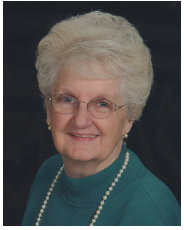
February 2, 1934-December 1, 2021