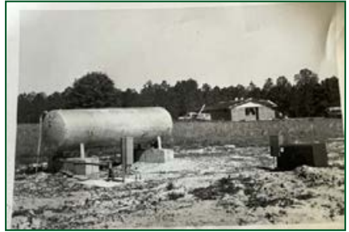
First dormitory building

This building is now known as the Hellen Keller Building. Most recently referred to as the renovation building. It is amazing of the stories one picture can tell you. How today there are several other buildings added to this site. The fields are bare and if you will notice the tree in the background behind the water tank. Notice its size back then.