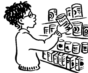
giving to people in need

Welcome to worship. Today is the second Sunday in Lent. During Lent, people get ready for Easter by: