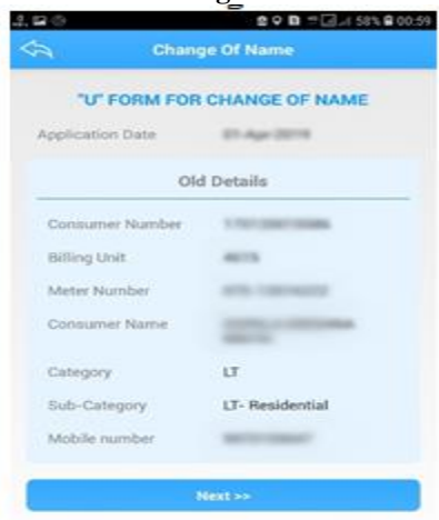
Figure3(a): Apply for name change [3]