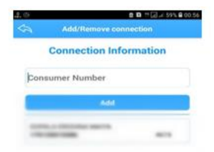
Figure 1: Add/Remove connection [3]