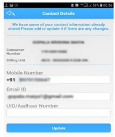
Figure.2: Update contact info [3]

Fig.2 represents the feature showing the contact details like phone number, email-id and UID/Aadhar Number which could be misused in many different ways. The phone number and email-id can be used to send spam messages or emails further trying to hack the consumer's mobile phone or personal computer. The guest user also has access to change the contact details of the consumer, creating some troublesome activities.