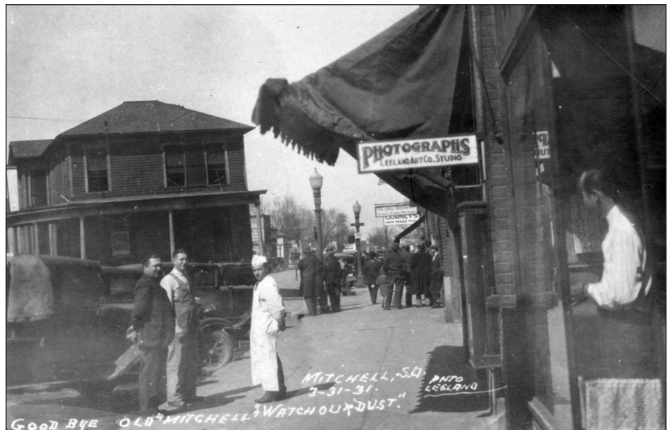
This photo dated 3-31-31 taken in Mitchell, SD has a caption on the picture that reads, "GOOD BYE OLD 'MITCHELL': WATCH OUR DUST."