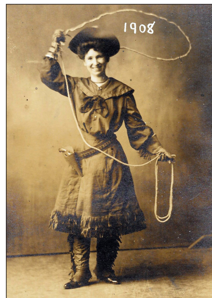
Cowgirls and Cowboys were certainly part of the South Dakota landscape especially in Western Dakota.