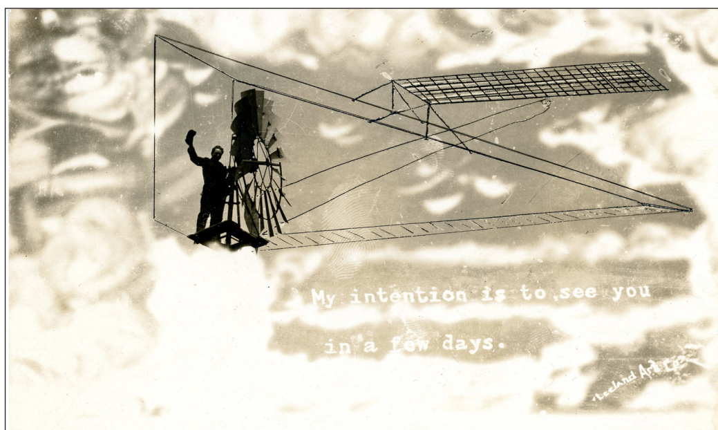
My intention is to see you in a few days. Fun Times with the camera!