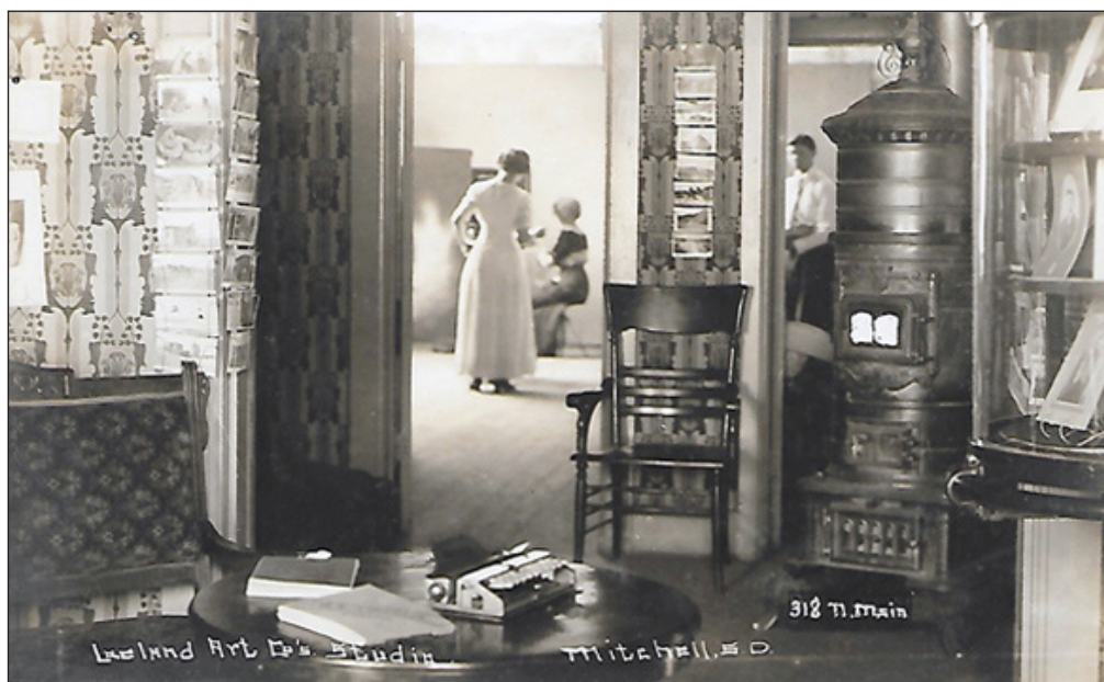
Interior view of the Leeland Art Co.'s Studio at 318 North Main, Mitchell, SD.