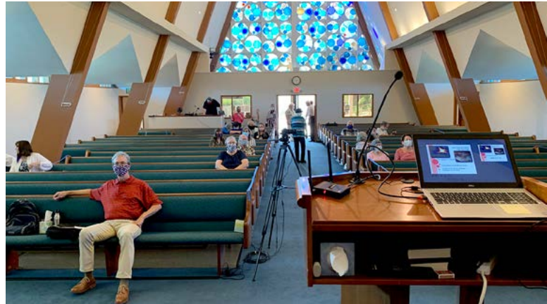
Above: The sanctuary is beginning to fill up with worshipers. We had nearly 50 people attend this first service.