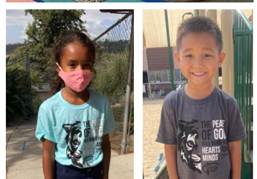
The students, staff, and volunteers at Trinity Christian School continue to learn to adapt to a new way of doing school. The joy of the Lord is still here!