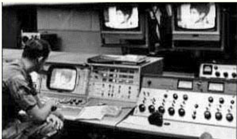
AFVN TV Control Room 1969