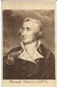
George Washington (1732-1799)

In December 1788, the United States is ready to hold its first elections under the new Constitution. Since each state sets its own time, the actual voting runs from December 15 to January 10, 1779.