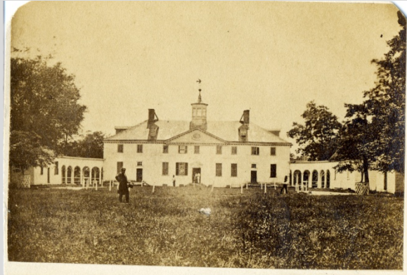
George Washington's Mt. Vernon Plantation – Slave Quarters Left of House

Washington inherits Mt. Vernon in 1752, at age twenty – and expands it from 2,000 acres to over 8,000 acres after he weds the very wealthy widow, Martha Custis, in 1759.