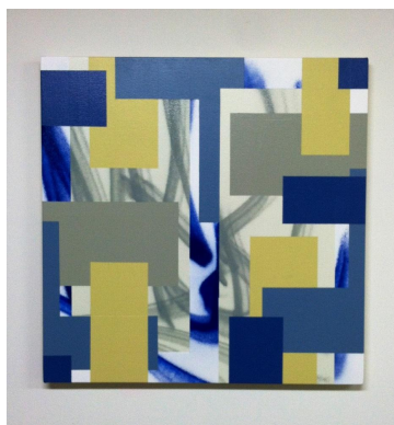
Karlos Cárcamo, Untitled (2013), acrylic and spray enamel on canvas, 24x24 in.