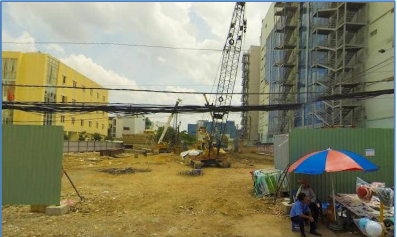
The MACV/DAO North Entrance.