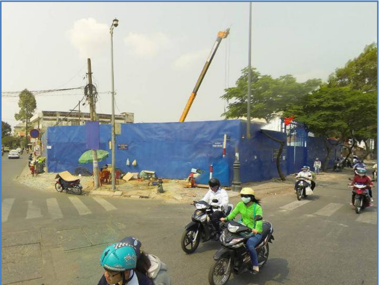
The site of the Medford BOQ.