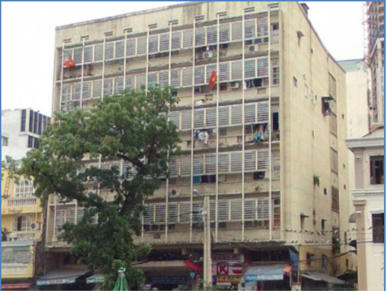
The Ambassador Hotel