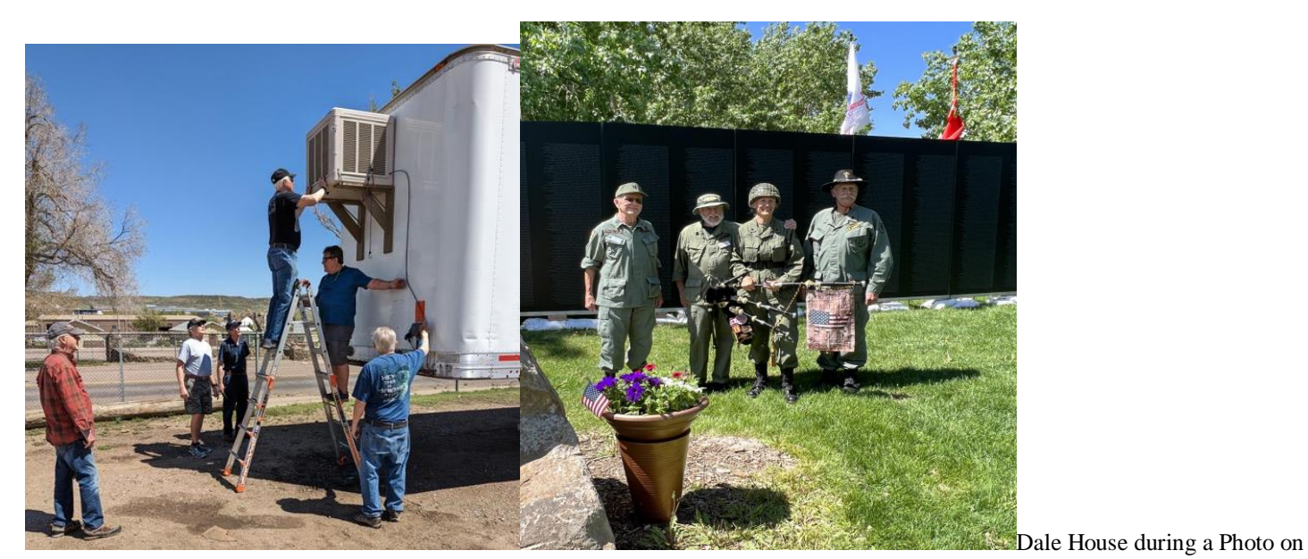
by the Traveling Wall with other enactors.