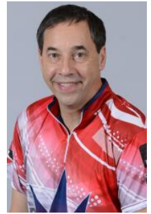
Parker Bohn III