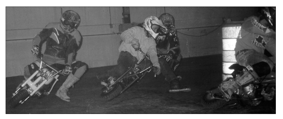
Tight Racing. Here's some first corner action.