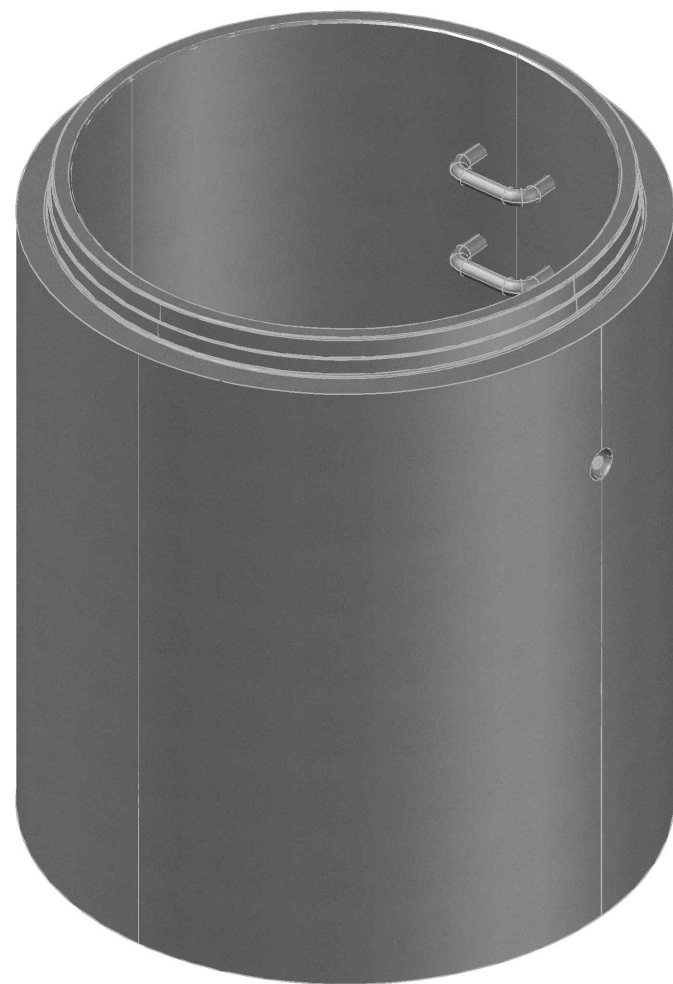
ISOMETRIC VIEW NTS