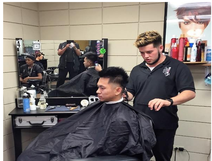
Hands on Training