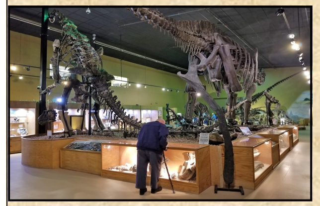
Skeleton of Supersaurus so big you can not get it all in one photo.