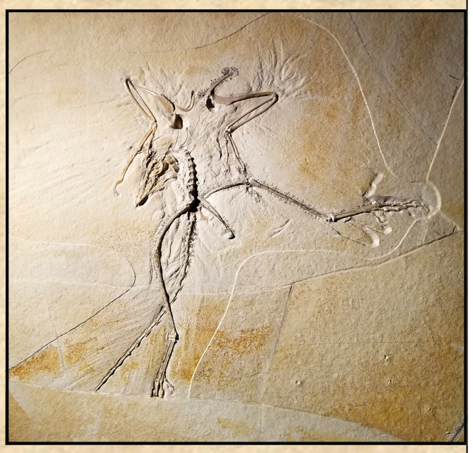
Archaeopteryx at the Wyoming Dinosaur Museum in Thermopolis.

Next we visited the Wyoming Dinosaur Center across town. The museum is famous for its actual fossil of the prehistoric bird Archaeopteryx from the lithographic limestone in Germany. It is the only specimen on display in North America and was number one on my to-do list for the trip. They also have the full mounted