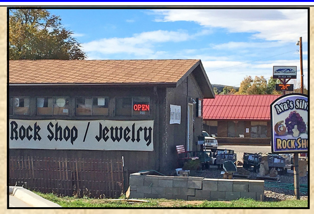
Ava's Rock Shop Thermopolis Wyoming

The next morning we found Ava's Rock Shop and Silver Jewelry Store, were we saw beautiful Wyoming florescent agates that produce an iridescent, gorgeous green color under black lights. I also found the complete lower jaw teeth of the giant Terror Pig Archeotherium in their fossil section. I grabbed these immediately. Ava's was one of the best rock shops in Wyoming. She has many speci-