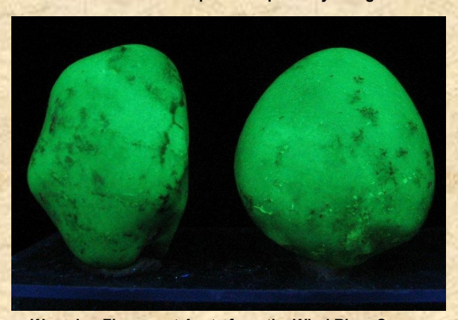
Wyoming Florescent Agate from the Wind River Canyon