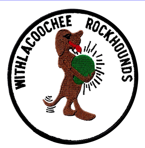
Hernando County, FL

On the nights of our club meetings (second Wednesday of the month) the Weeki Wachee Senior Citizens Center is open at 5:30 PM. The rock grinding and cutting machines are set up early so members can use the equipment before the business portion of the meeting begins at 7:00 PM. If you have jewelry, rocks, minerals, fossils or equipment to show or sell, specimens to be identified; the best time to do so is between 5:30 PM and 7:00 PM. No equipment can be used during the business meeting or during presentations.