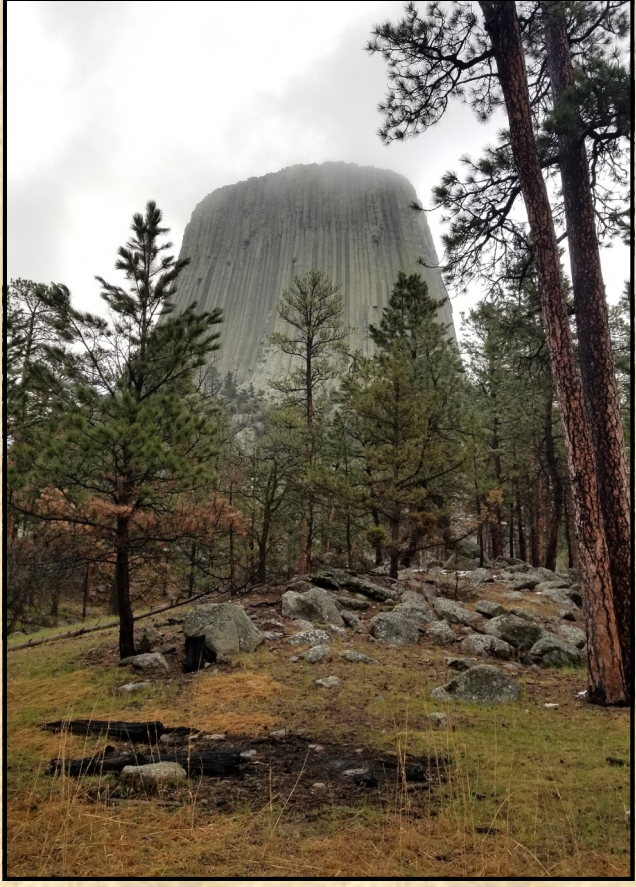
Devil's Tower in the mist and rain

Next we traveled eastward to the Devils Tower National Monument. We spent the night in Hulett, at another Best Western that was built as an amazing log cabin chalet. The next morning we drove the twelve miles to Devils Tower and visited their gift shop for