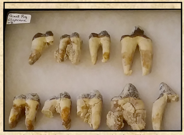
Archeotherium lower tooth series from Wyoming

mens of cutting grade dinosaur bone and thousand of mineral specimens.