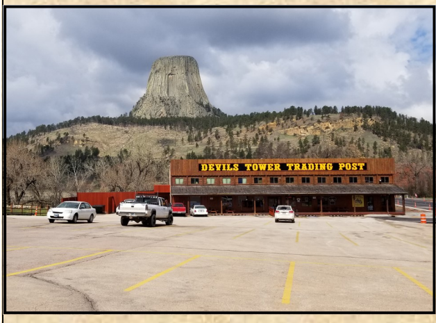
Devil's tower trading post

Next we traveled eastward to the Devils Tower National Monument. We spent the night in Hulett, at another Best Western that was built as an amazing log cabin chalet. The next morning we drove the twelve miles to Devils Tower and visited their gift shop for