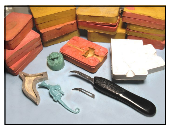
The hawkbill blade for cutting molds.

Cutting molds is easier and more precise with a sharp blade. A new Xacto blade is sufficient for cutting RTV molds but is usually not sharp enough for vulcanized rubber. For that it is best to use scalpel blades available from most jewelry supply companies. The #11 blade is triangle shaped, and the #12 is hawkbill shaped. I find that the hawkbill is particularly nice for cutting the registration keys of the mold.