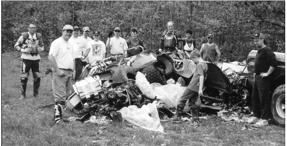
Here's three truck loads of household trash taken out of the woods!

He had to let the bike sit for fourteen years, but now he's able to do some riding again.