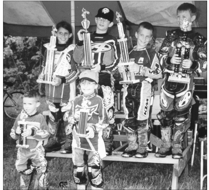
The Winners of the Youth Division