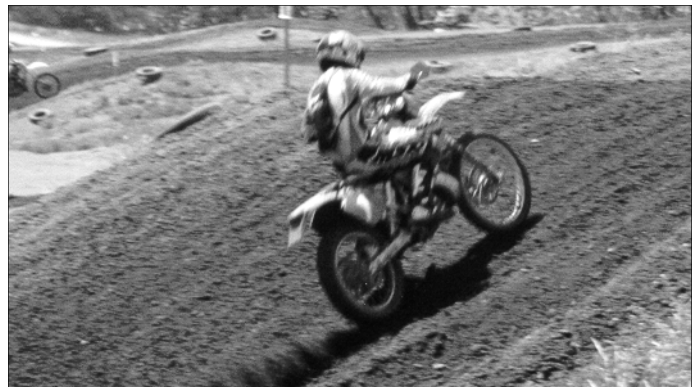
Shane Watts on his way to victory

There's another AMA National Hare Scramble coming up in our neck of the woods, on September 16 at Park Hills, MO. Be there. As long as you pay your entry fee, the promoters don't care when you quit. I got in all the racing I wanted and got to see the big dogs finish.