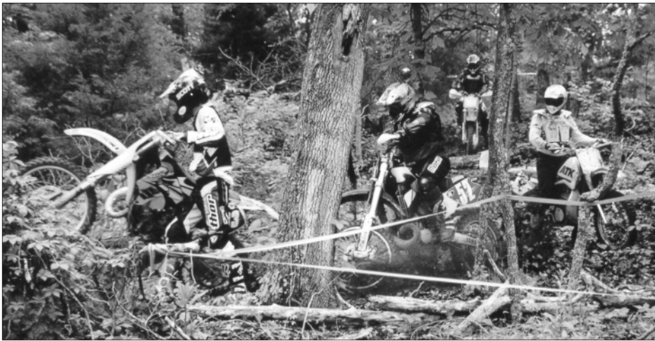
Things got a little busy in the woods.