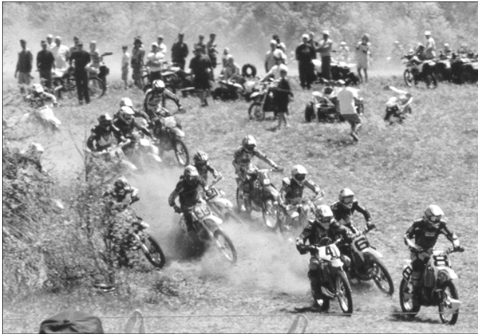
The start of the Pro Class

It's one thing I really like about this sport. Anybody with a dirt bike and $40 could sign up and ride with the best riders in the country. 275 riders signed up for the Midwest Motosport National Hare Scramble Championship held at Kahoka, MO, most of which are like myself, just there to have fun and say they were lapped by the best. In some cases more than once.