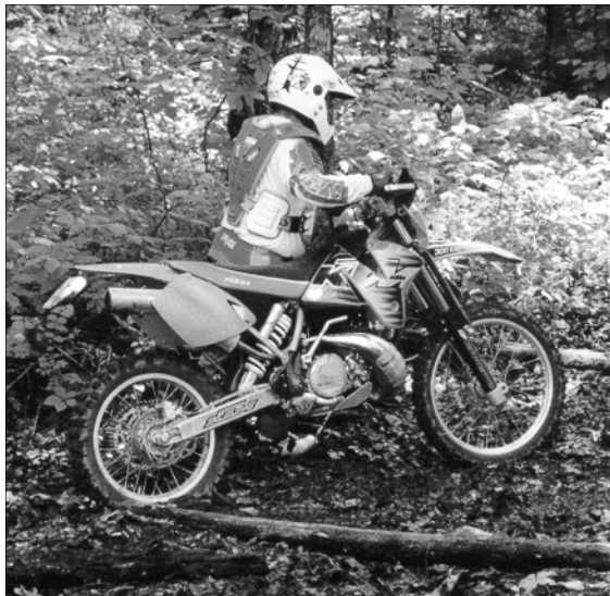
Coy, log crossing method two