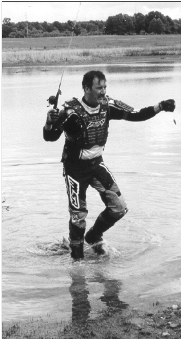
No, it's not the Creature From the Black Lagoon. It's the author attempting to fish.