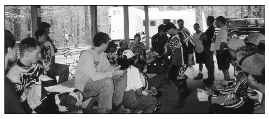
Here are the helpers getting the give-a-ways.

That night, we got some quality camp fire sitting time.