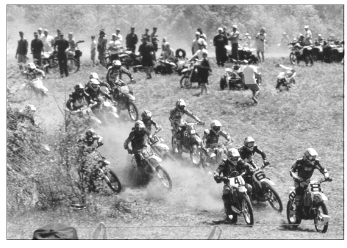
The start of the Pro Class

It's one thing I really like about this sport. Anybody with a dirt bike and $40 could sign up and ride with the best riders in the country. 275 riders signed up for the Midwest Motosport National Hare Scramble Championship held at Kahoka, MO, most of which are like myself, just there to have fun and say they were lapped by the best. In some cases more than once.