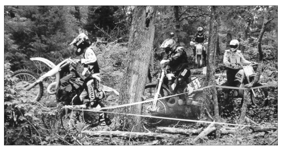
Things got a little busy in the woods.