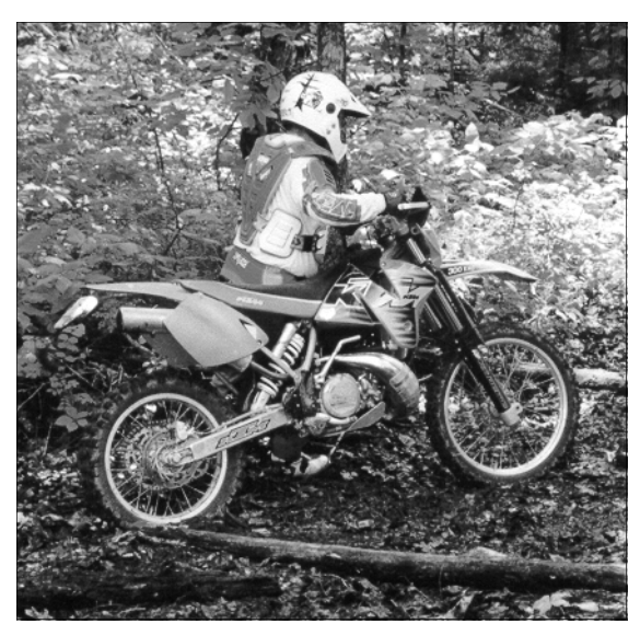
Coy, log crossing method two

also. But how much help he was is questionable.