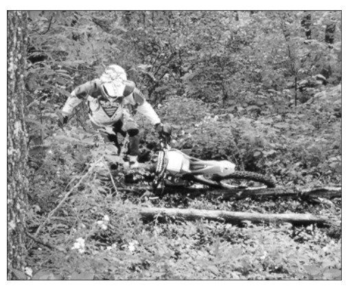
Coy, log crossing method one.

Greg's brotherin-law Rocky finally took pity on the four remaining nonfisherpersons and told us to go ride our motorcycles.