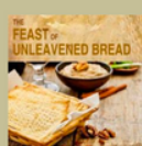
Sunday, April 13 Saturday, April 19