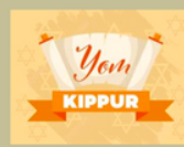
Wed. Night/Thursday Oct 2