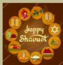
Sunday night Monday June 2