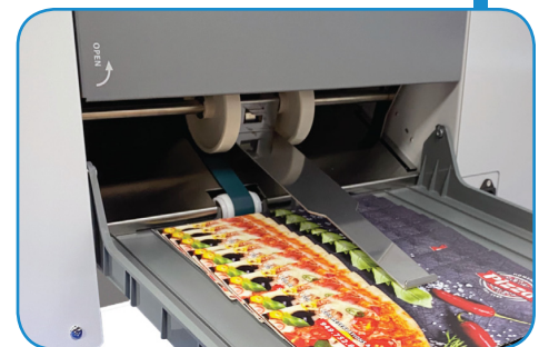
Out-feed Stacking Belt & Rollers: Automatically adjusts to paper size, with two tray positions available.

Formax - New Hampshire, USA www.formax.com