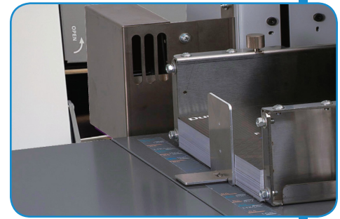
Side Air System: Enhances feeding of heavy stock and large paper sizes