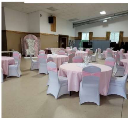
Sweet 16 Party