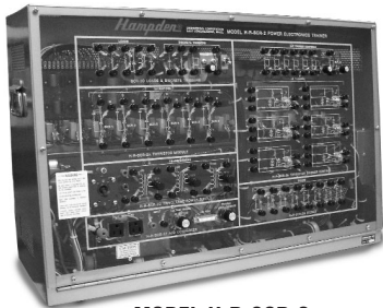
MODEL H-R-SCR-2 Dimensions: 18"H x 32"W x 12"D Shipping weight: 229 lbs

The Model H-R-SCR-3 Power Electronics System has been designed to be used together with the H-R-SCR-2 Power Electronics System, acquiring the AC power and processed DC voltages needed for the experiments from the Trivoltage Power Supply Module H-R-SCR-2D, as well as expanding the capabilities of the H-R-SCR-2 . The Model H-R-SCR-3 is designed to demonstrate the following: Smoothing Inductors, High-Speed Switching Devices, Signal Converter, P.I.D. Control Panel, IGBT and MOSFET Drivers.