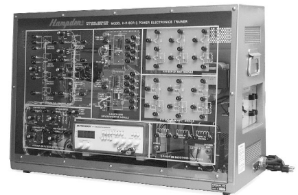
MODEL H-R-SCR-3 Dimensions: 21"H x 32"W x 12"D Shipping weight: 229 lbs

A dual trace triggered 20MHz oscilloscope and a 3 \phi AC Motor are OPTIONAL recommended accessories for the Model H-R-SCR-3 .