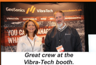
Great crew at the Vibra-Tech booth.