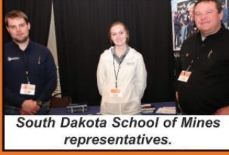
South Dakota School of Mines representatives.