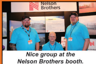
Nice group at the Nelson Brothers booth.