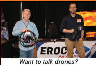
Want to talk drones?