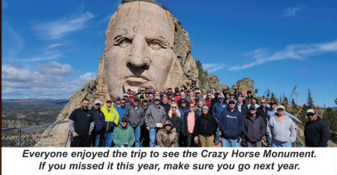
Everyone enjoyed the trip to see the Crazy Horse Monument. If you missed it this year, make sure you go next year.