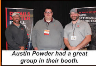
Austin Powder had a great group in their booth.