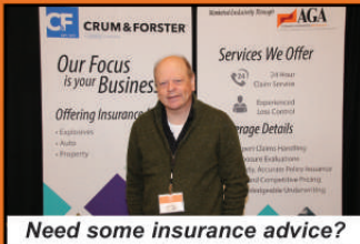
Need some insurance advice?