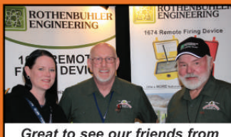
Great to see our friends from Rothenbuhler Engineering!