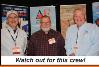
Watch out for this crew!