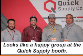
Looks like a happy group at the Quick Supply booth.