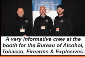
A very informative crew at the booth for the Bureau of Alcohol, Tobacco, Firearms & Explosives.