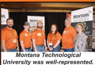
Montana Technological University was well-represented.