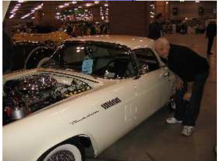
An "E" Bird in your future ?