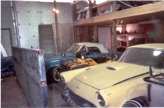
These are For Sale