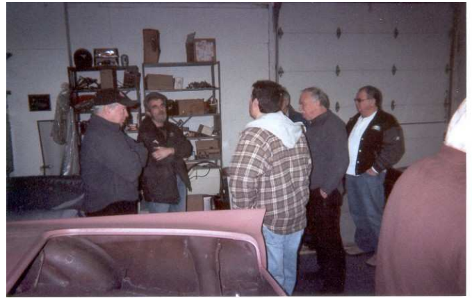
Learning more about TBirds