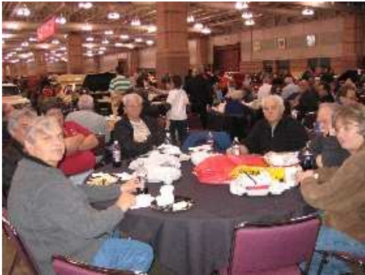
Chow and rest time

Prices seemed down and since we didn't follow the cars going over the block we don't know how many sold.