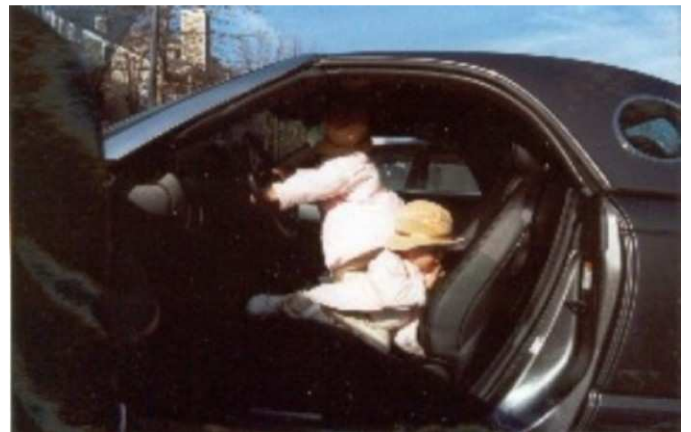
In his retro Bird – Age 18 months