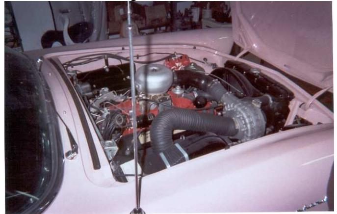
One of the owner's 'F' Birds