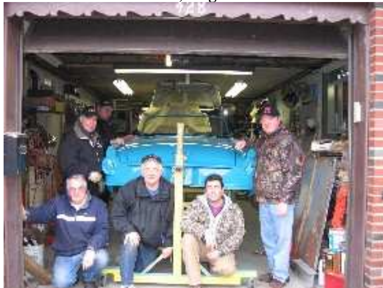
Charles' #2 car comes home

Chatterbox-Rtes 15&206, Augusta Start 5/2