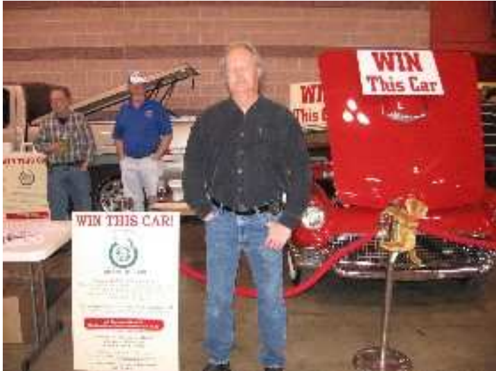
Take a chance