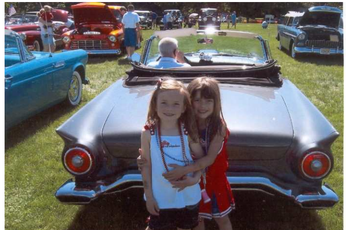
5 years old - 2008