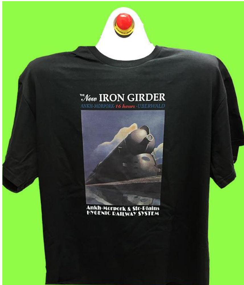
The New Iron Girder – Someday...

Sometimes I find a fellow fan and sometimes I find people who at first glance just think I am a classic train buff. A closer examination of the shirt leads to a fun discussion about the works of Terry Pratchett. Either way, the shirt starts conversations and I couldn't ask for more than that.