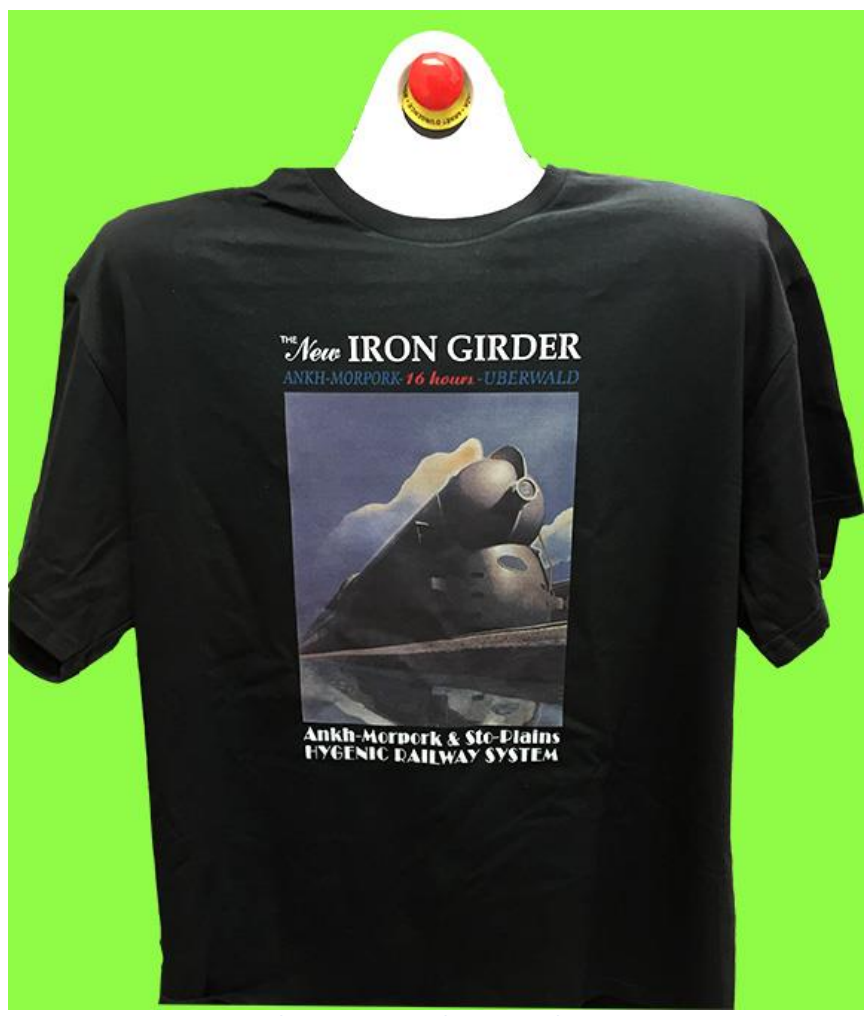
The New Iron Girder - Someday...

Sometimes I find a fellow fan and sometimes I find people who at first glance just think I am a classic train buff. A closer examination of the shirt leads to a fun discussion about the works of Terry Pratchett. Either way, the shirt starts conversations and I couldn't ask for more than that.