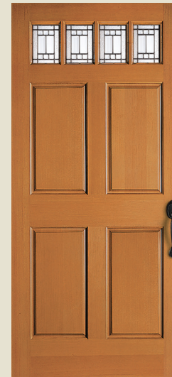
PORTSMOUTH® IV 4284 door with black coming. Privacy Rating 7.