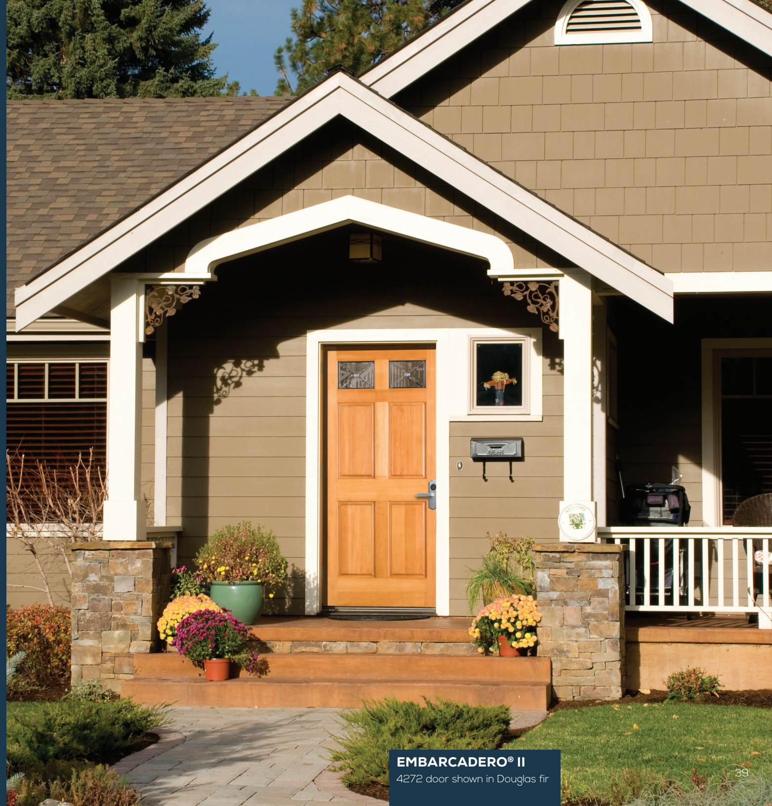
EMBARCADERO® II 4272 door shown in Douglas fir