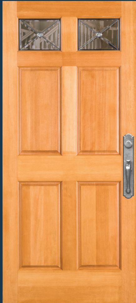
EMBARCADERO® II 4272 door with silver coming. Privacy Rating 5.