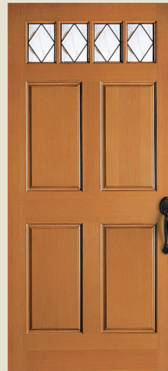
QUEEN ANNE® IV 4294 door with black coming. Privacy Rating 7.