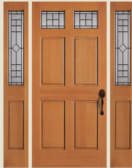
VENETIA® II 4234 door, 4235 sidelights with black coming. Privacy Rating 7.

VIEW ENTIRE SELECTS SERIES simpsondoor.com/selects