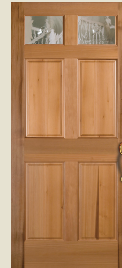
4230 Shown in western red cedar with bullion glass. Privacy Rating 5.